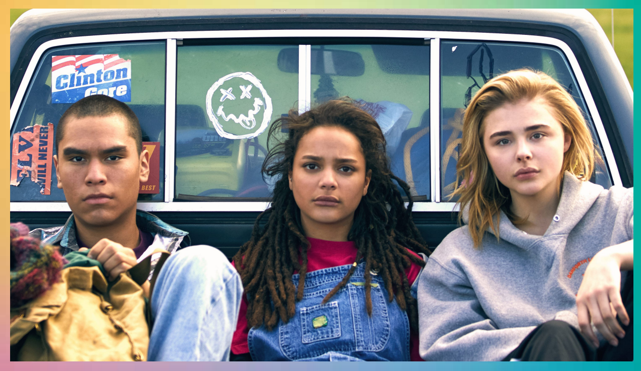
THE MISEDUCATION OF CAMERON POST (2018), 29th Fresno Reel Pride Film Festival

Keeping with tradition, Fresno Reel Pride gives back to young people by providing discounted tickets and free screenings of youth-centric films now known as our Discoveries - Youth program.