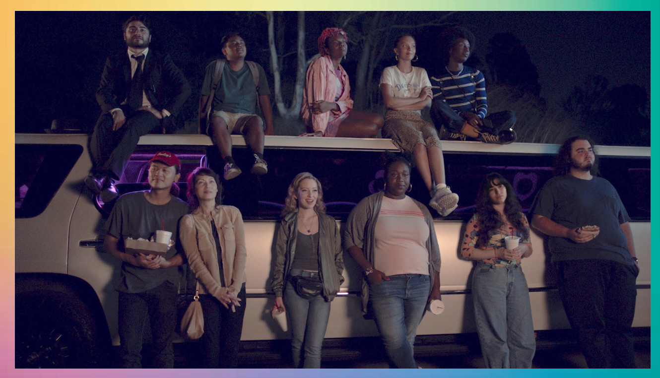
SUMMERTIME (2021), 32<sup>nd</sup> Fresno Reel Pride Film Festival

This year, the 33<sup>rd</sup> Annual Fresno Reel Pride Film Festival will be held September 30 – October 2, 2022 at Fresno City College.