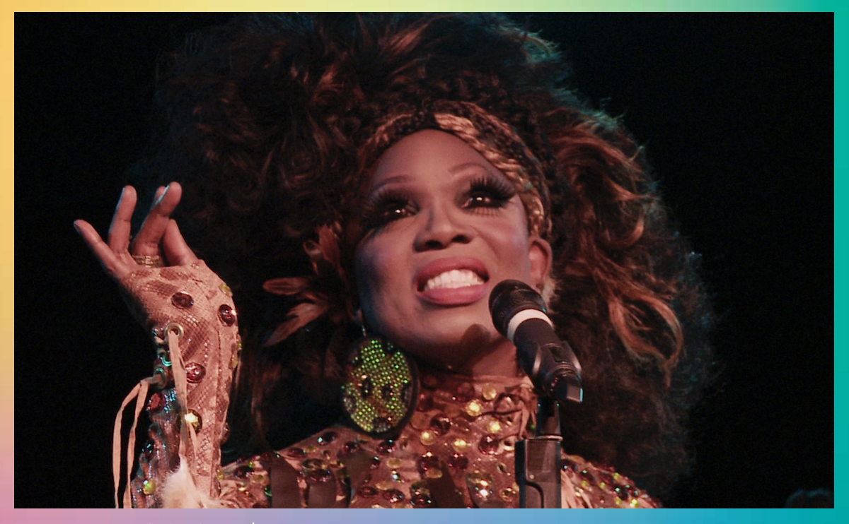
BEING BEBE (2021), 32<sup>nd</sup> Fresno Reel Pride Film Festival

We pride ourselves in bringing programming not found at your traditional theater. Genres have included dramas, comedies, horror films, animations, documentaries, and international films.